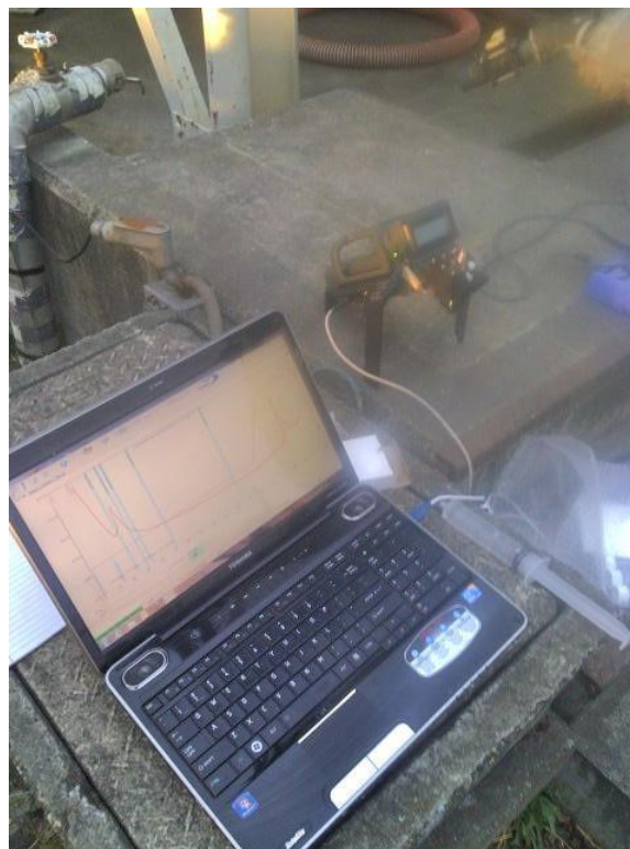
Figure 2: The FROG 5000™ is at well EW-1 analyzing water live in the field. The large syringe pictured next to the laptop is used to rinse the sparge bottle and sparge needle between samples.

The sampling event started at 7AM on October 3rd, 2012. We sampled 5 wells named EW-1, SP-1, EW-2, EW-3, and EW-5.